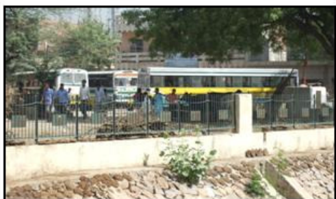
2. THE BUS TERMINUS

Entry to Aya Nagar is through a narrow road with heavy traffic. The road between junctions 1A AND 1B has been closed 4 times in the last 10 months for 3-4 days in a row for repair work. It is the most important connection of Aya Nagar with the M.G road and frequent closure makes the traffic conditions unmanageable.