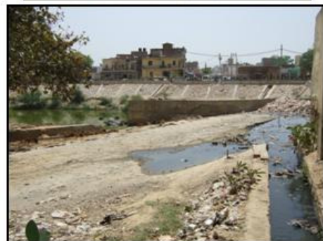
3.WASTE DISPOSAL IN THE JOHAR

The drains carrying solid waste, garbage and sewerage from Aya Nagar flows into the Johar, making it derelict.