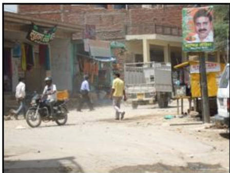
1B. THE ROAD ALONG THE JOHAR

Entry to Aya Nagar is through a narrow road with heavy traffic. The road between junctions 1A AND 1B has been closed 4 times in the last 10 months for 3-4 days in a row for repair work. It is the most important connection of Aya Nagar with the M.G road and frequent closure makes the traffic conditions unmanageable.