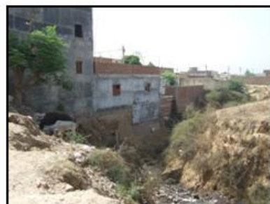
5.FILLING UP OF RAVINES

The ravines are being filled up and large scale construction activity is taking place.