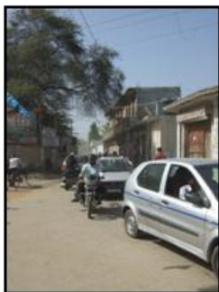
1A. ENTRY TO AYA NAGAR