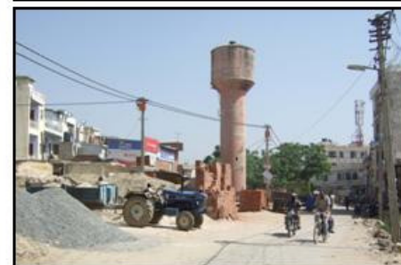
8. BUILDING MATERIAL SHOPS

These shops along the main roads and inner lanes create traffic problems and are safety and health hazards.