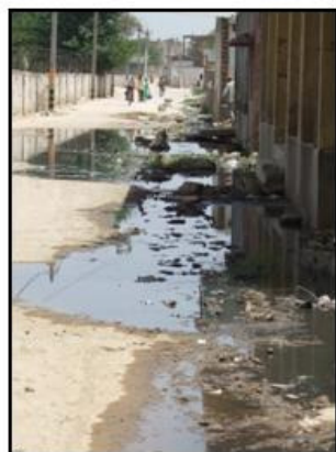
4. LACK OF PROPER DRAINAGE

The drains carrying solid waste, garbage and sewerage from Aya Nagar flows into the Johar, making it derelict.