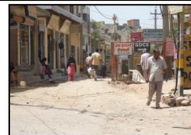
7. The location of the transformer and the hump in the middle of the road creates traffic bottlenecks.